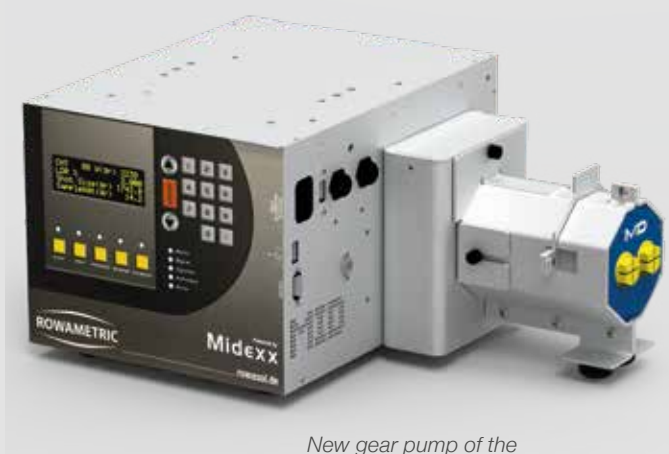
New gear pump of the ROWAMETRIC dosing systems series

When using liquid colors in extrusion applications, pressure injection offers the possibility of dosing the color downstream, e.g. on the processing section of the extruder or even downstream in the melt pipe. In this way, extremely fast color changes can be produced.